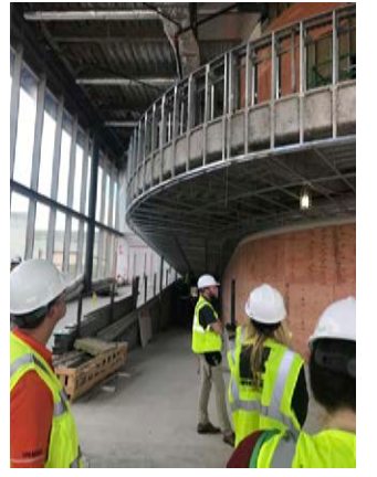
Hall of Honor